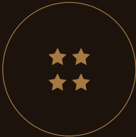
4 STAR NABERSNZ RATING