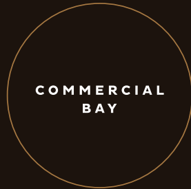
DIRECT ACCESS TO COMMERCIAL BAY