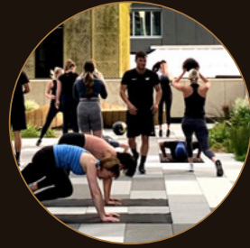
ACCESS TO THE CLUB