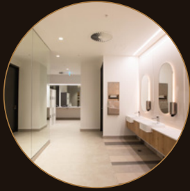
END OF TRIP FACILITIES